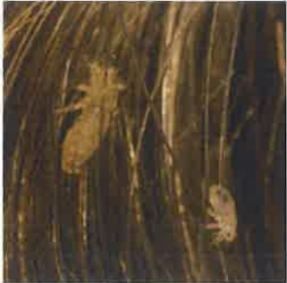
Image of real lice