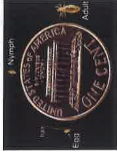
Lice at various stages of their life cycle

Treatment: The Iowa Department of Public Health recommends a 14-day treatment process. You may use over-the-counter products. They are safe and not costly. Mark your calendar to help you keep track of treatment.