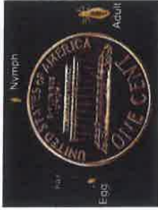
Lice at various stages of their life cycle

Treatment: The Iowa Department of Public Health recommends a 14-day treatment process. You may use over-the-counter products. They are safe and not costly. Mark your calendar to help you keep track of treatment.