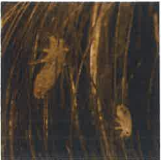
Image of real lice